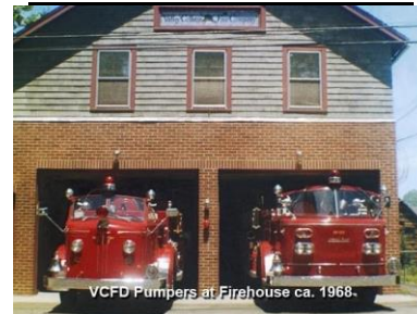
Valley Cottage, 1968